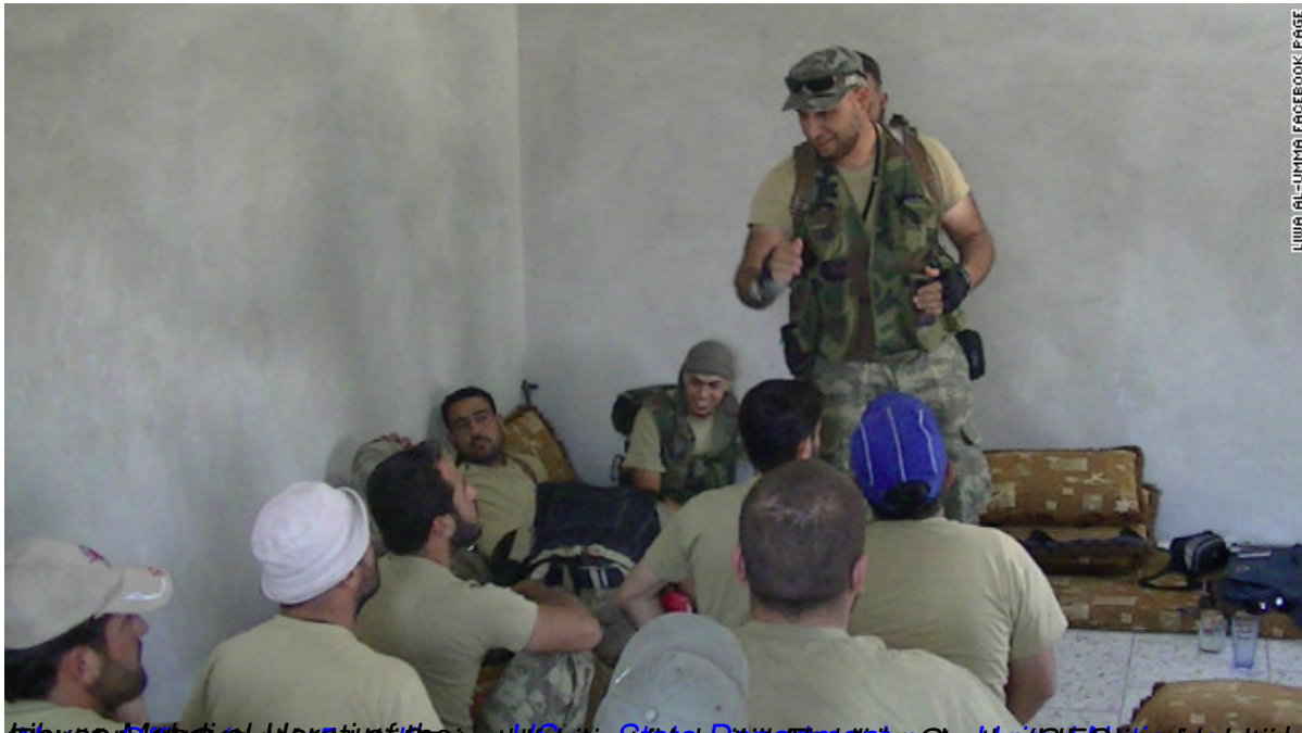
LUMA AL-UNIMA FACEBOOK PAGE