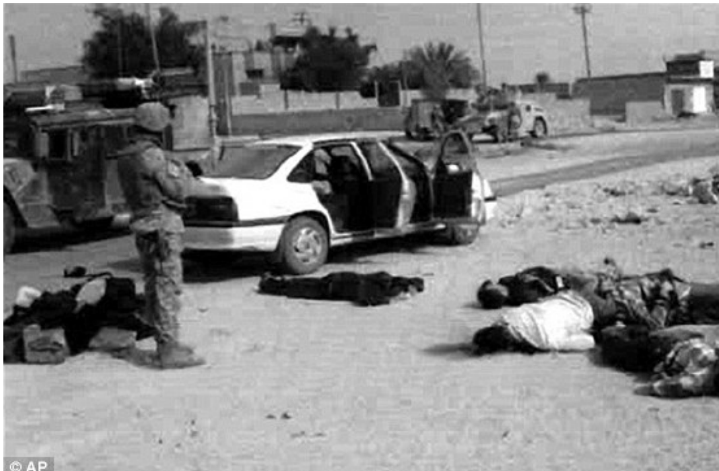
@amagenThehaltleermath of the shooting in Haditha. A total of 24 people were killed, including